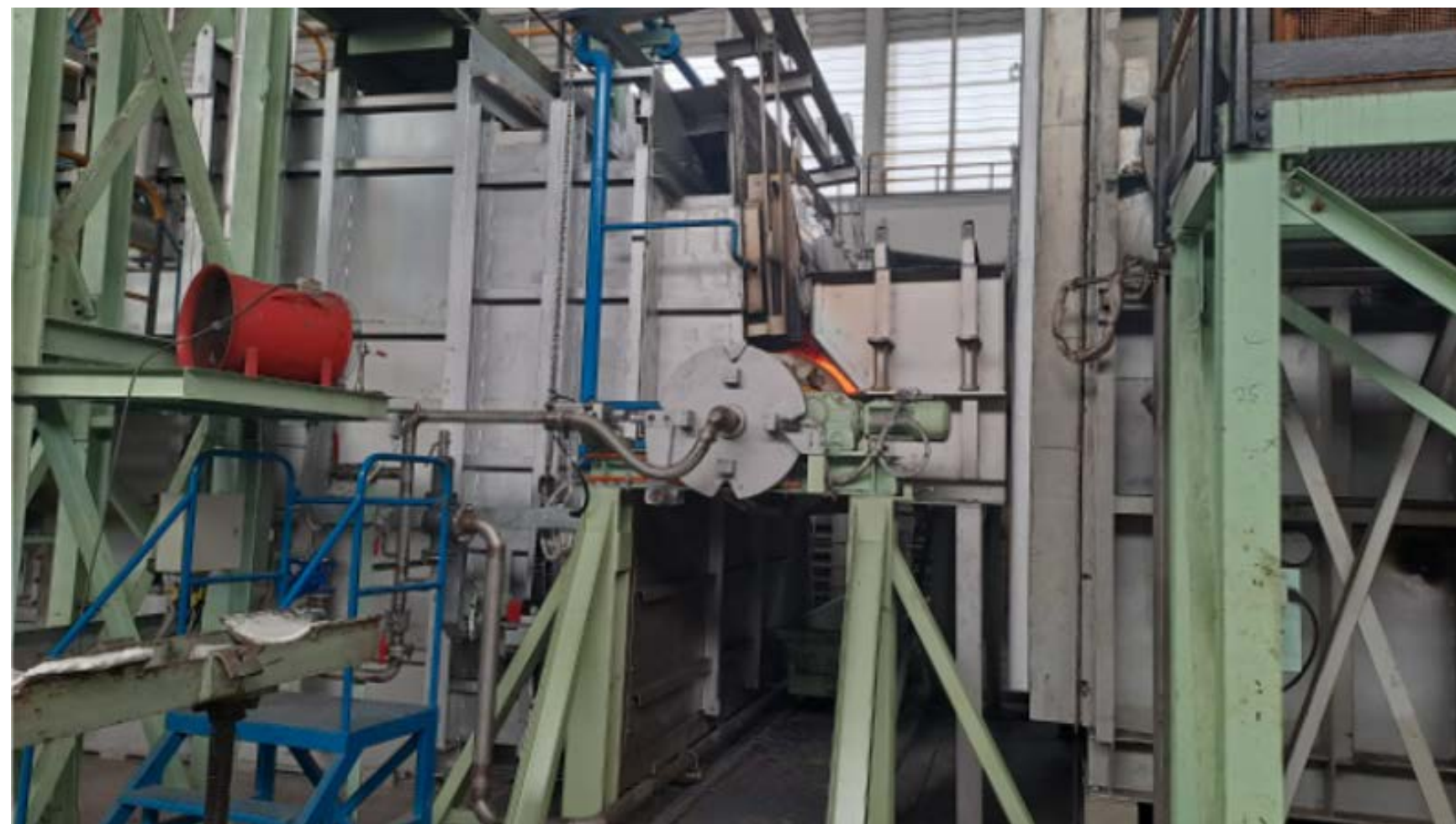
New furnace exit connects to hot cooling section after revamping

energy operation cost and improve the energy intensity. The gas consumption reduction not only has direct savings in terms of energy cost, but also contributes to the correlated Scope 1 GHG emission reduction that aligns with the climate change mitigation action and the ESG commitments.