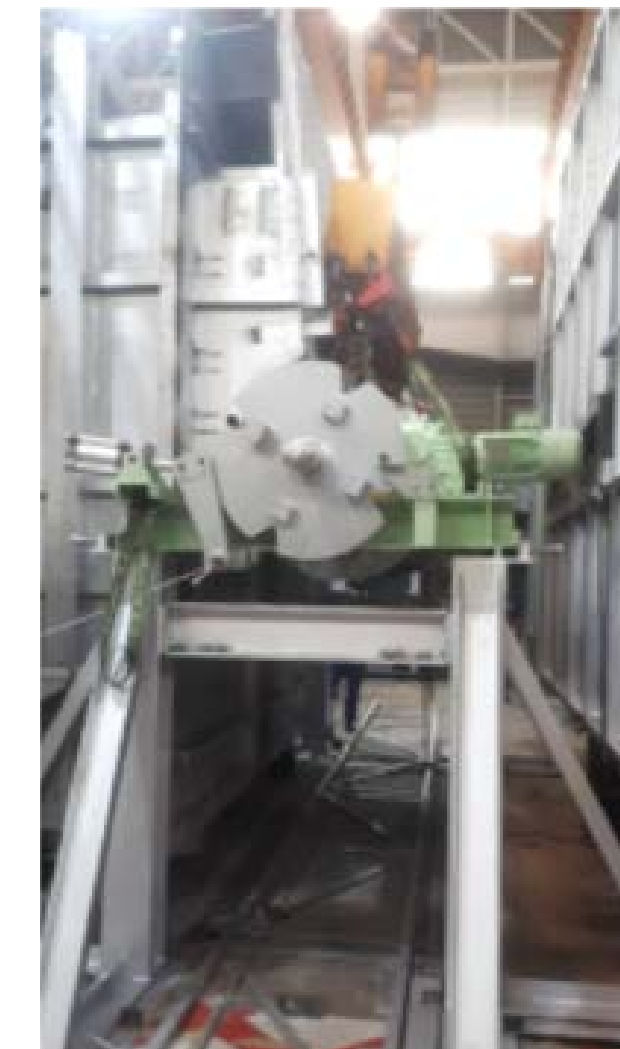
Position of Carousel Roll

consumption after the revamping modification is measured and made comparison to the previous gas consumption trend to indicate the efficiency of gas consumption had been achieved.