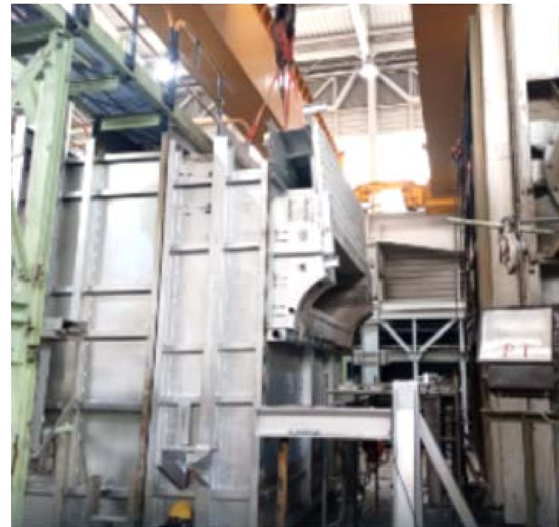
New furnace Exit lifting structure in position